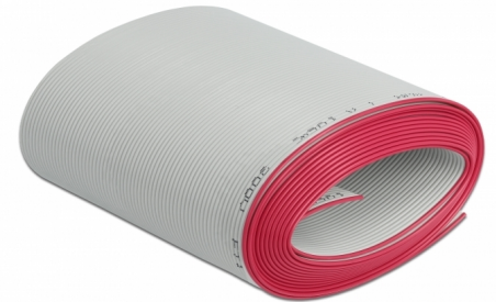
64 Pin / 2 m

This flat cable by Delock allows cable assembly with existing connectors for flat cables. The cable has 64 individual strands and can be used e.g. in test environments or in hobby applications.