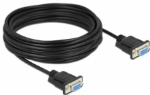
mini Sub-D 9