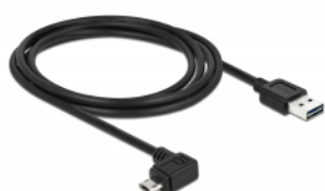
EASY-USB Micro B