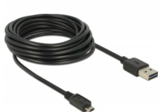
EASY-USB Micro B