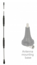
Antenna mounting base